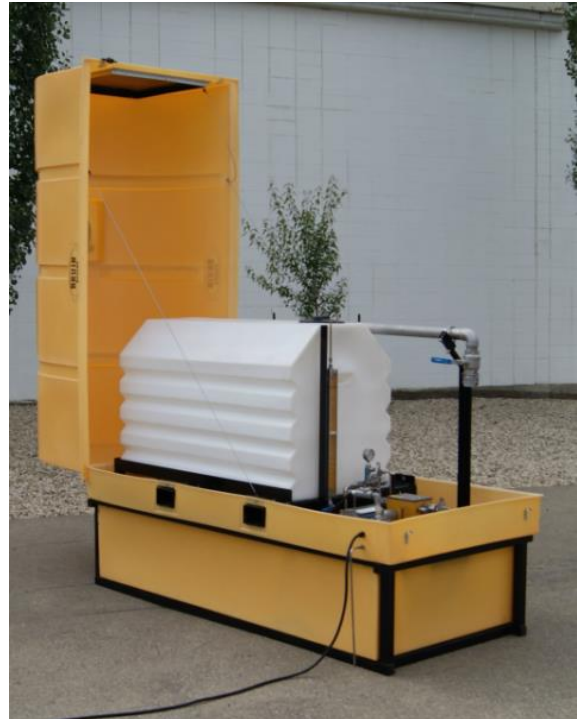
ECP with Lid Open