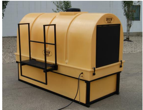
ECP with Optional Safety Access Stairs