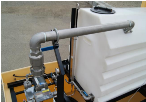
Optional Tank Top Fill Camlock Connector