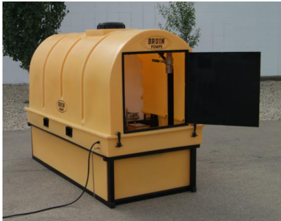
ECP with Access Door Open