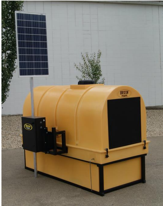
ECP with Solar Controller and Solar Panel