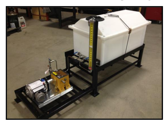
Solar Pump Packages with Various Tank Sizes Small Profile Solar Pump Packages