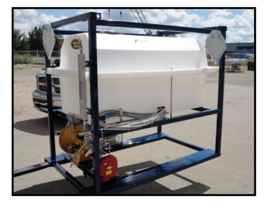
Custom Built Skid Packages with Various Pump and Tank Options to Meet Customer Requirements