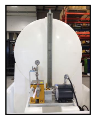
Full Enclosures and Full Containment Pump Skid Packages Available