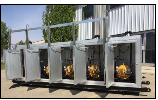
Still not sure what Bruin Pump Package best fits your needs and requirements?

Why not give Bruin Instruments a call and we can assist in ensuring you get the right Pump Package for your specific requirements and location.